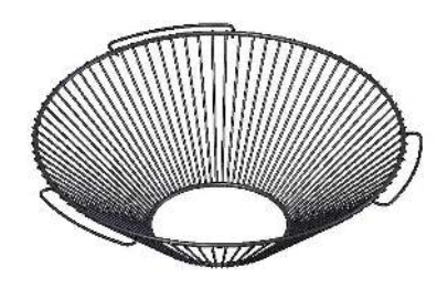
Optional coated stainless steel bottom screen helps protect the unit from debris. The bottom screen has 84 vertical bars with gaps less than 1"