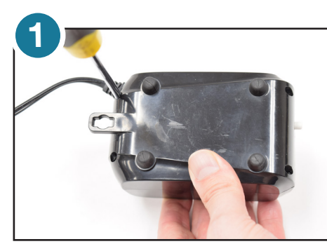
1. Unplug unit and remove four screws from bottom housing.

Diaphragm Replacement Instructions for CMC3 - Single Outlet Compressor used in CAS1 Kit