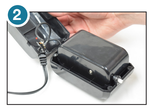
2. Carefully lift top of housing back to access internal housing.