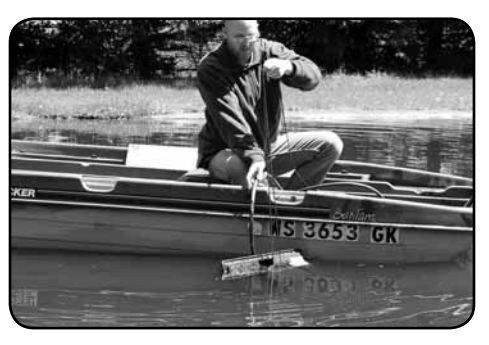
9. Use rope looped around diffuser to assist lowering assembly to pond bottom.