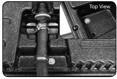
6. Use washer on both sides of base. Insert 10mm bolt and tighten nut to clamp down tubing and provide strain relief.

(Use 17.5mm clamp for <sup>3</sup>/<sub>8</sub>" tubing) (Use 25.5mm clamp for <sup>1</sup>/<sub>2</sub>" tubing)