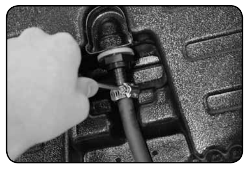
4. Slide hose clamp back over tubing and fasten with regular screwdriver or nut driver.