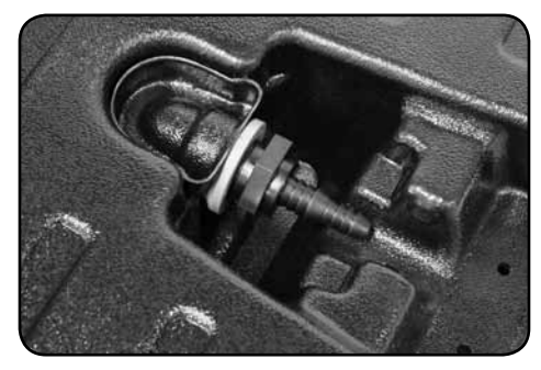
2. Flip diffuser base upside down and screw in barbed fitting until snug.