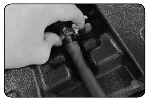
3. Slip hose clamp over barbed check valve and push tubing tightly onto the fitting.