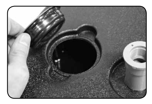
7. Remove plug on the top of the base and fill about half full (3 to 5 lbs.) with sand, rock or gravel.