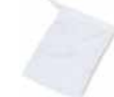
Sludge collection bag