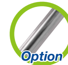
Option Stainless steel extension pipe