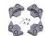
Feet / pipe holder