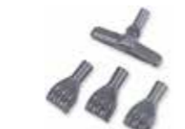
3 adjustable floor nozzles (2, 5, 10mm)